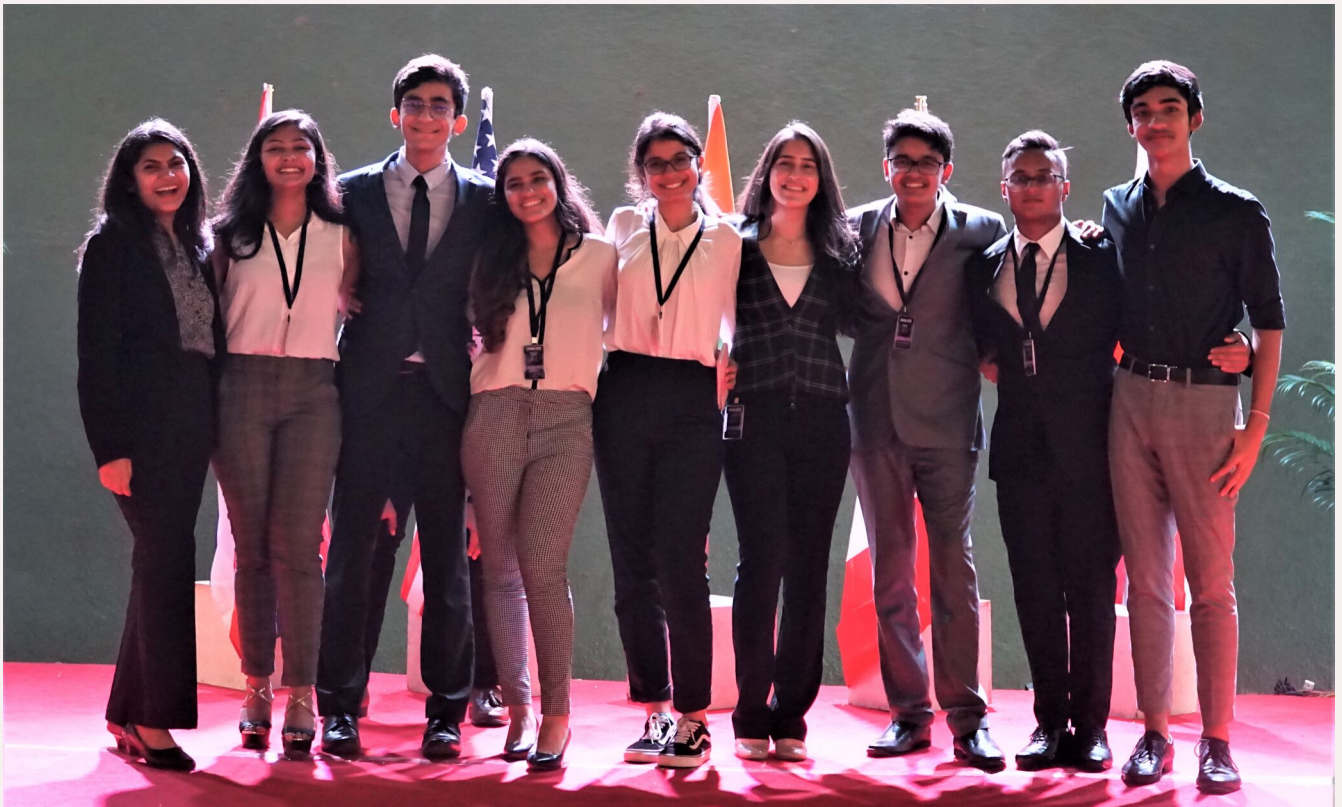
THE SECRETARIAT OF CIMUN 2019