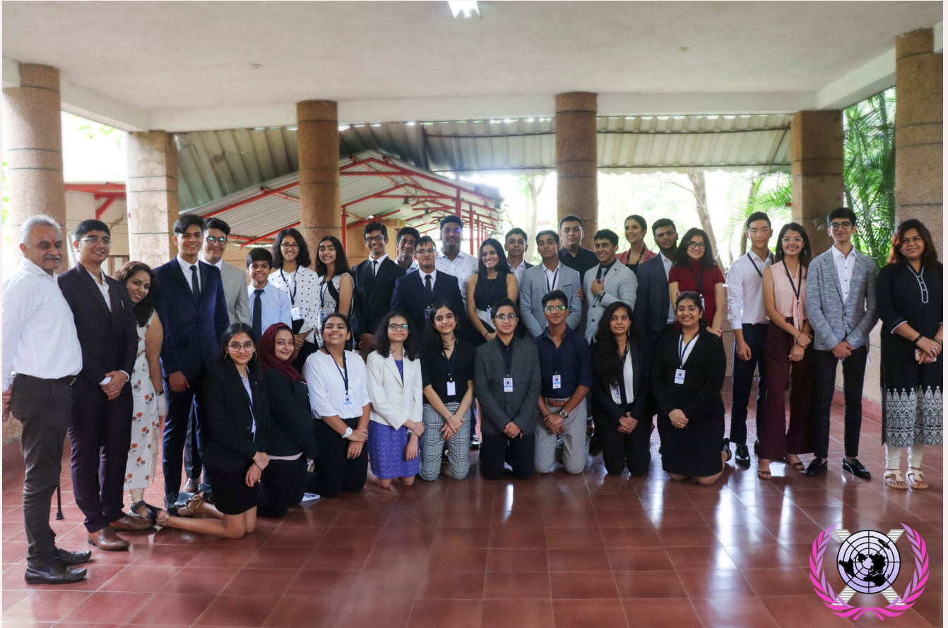
THE INTERNATIONAL PRESS CORPS